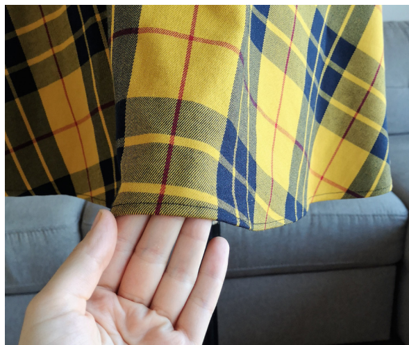
Hemline from the right side of the fabric.

5. Carefully iron the hemline and you are done!